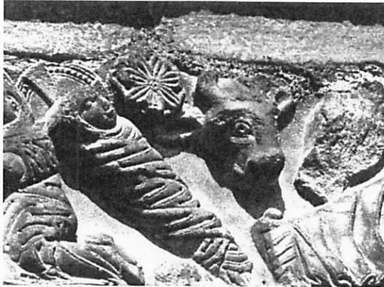
Nativity from the Pyrenees

The result of the divine intervention was only a creature; this time, the result is equal to the Infinite. (...)