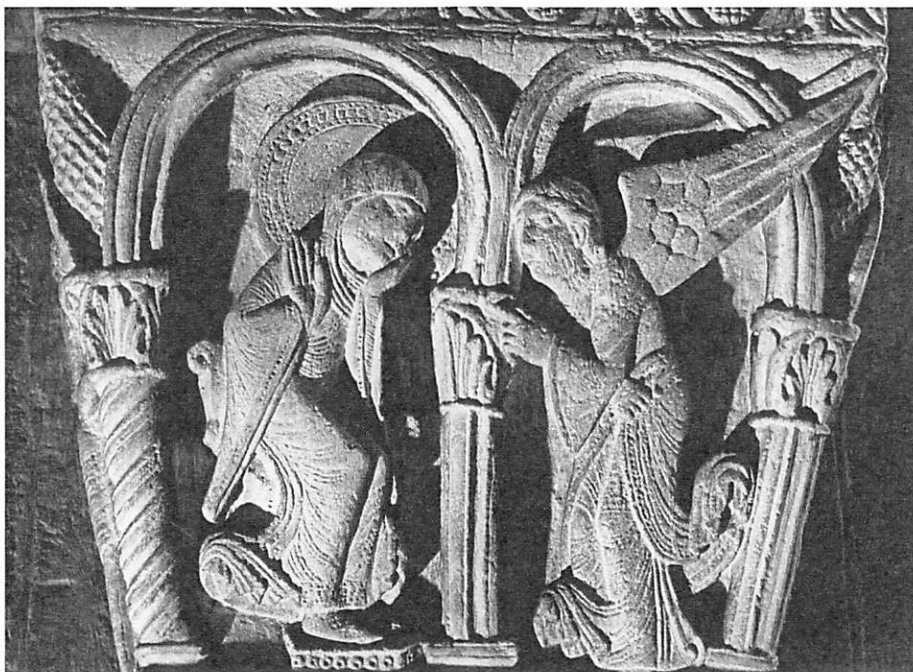
The Annunciation (Cathedral of Autun, France)