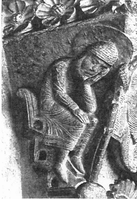
Saint Joseph (Cathedral of Autun)

“Joseph understood the role that was confided to him in the birth of Jesus; he considered himself to be the guardian of two holy frailties, the virginity of his wife and the infancy of He who was to be born of her.