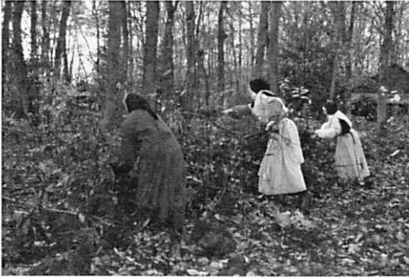
Valiantly, the sisters clean up the wood cleared by our faithful "lumberjacks": the dump truck put at our disposition is soon filled ...

For the feast of St. Francis, it is with an immense gratitude that we welcome the return of our masons who continue the cloister wall after a years halt. There are three of them and they work so quickly that we can see the wall growing before our eyes. Before Christmas, the second phase will almost be finished. In March, when winter weather has passed, the wall will receive its cap and the last coat of mortar.