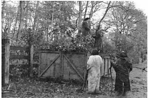
... and well stuffed by two sisters who almost fall through the branches into the bin several times!

The roofer came to repair several leaks in the roofs of two of our buildings that were due to moss and dirt having worked their way between the slates at the gutters' junctions. There was so much moss that while climbing down the roofer exclaimed: It's a garden up there!